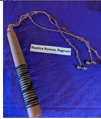
Replica of a Roman flagrum