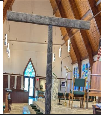
Type of cross used in crucifixion