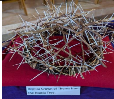
Replica of Crown of Thorn