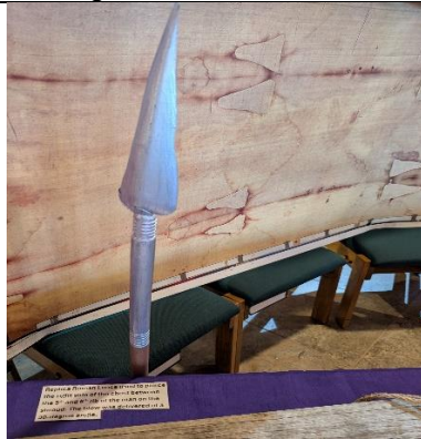
Replica Roman Lance used to pierce the right side of the chest