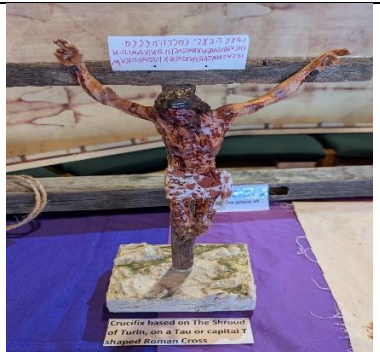
Crucifix based on the Shroud, on a Tau or capital T-shaped Roman Cross