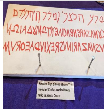
Replica sign placed above head of Christ, copied from relic in Santa Croce