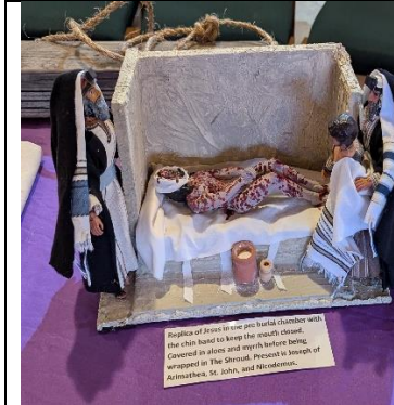
Replica of Jesus in pre-burial chamber with chin band to keep mouth closed; covered in aloe and myrrh