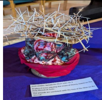
Replica of Jesus wearing the crown of thorns