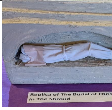
Replica of the burial of Christ wrapped in the Shroud