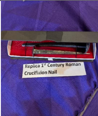
Replica 1 st Century Roman Crucifixion Nail