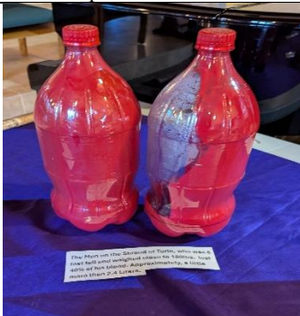
Man on the Shroud lost 40% of blood, approx. 2.4 liters