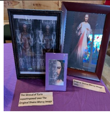
Shroud of Turin superimposed over the original Divine Mercy Image