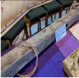
Beam carried on both shoulders to the place of execution